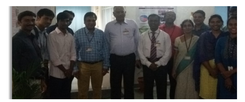
Microsoft selected students with 10.87 LPA-2019 Batch