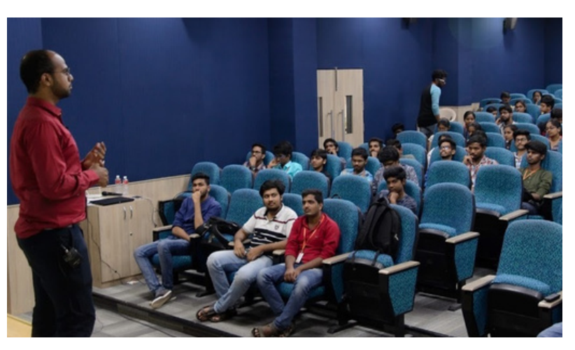
Workshop on Building Chat Bot using RASA