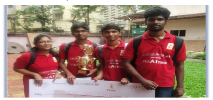
Team ENLIGHTENERS (II year) won cash prize of 50,000 in AI Hackathon at VESIT Mumbai-2019