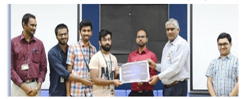
First Prize Winners of Turing Cup 2K19 from VNRVJIET-2019